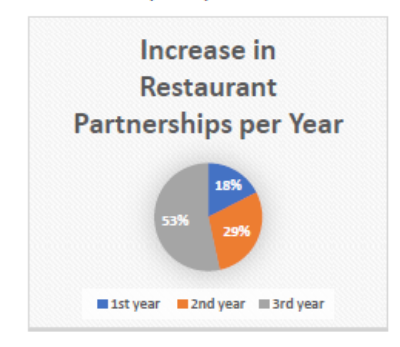
Figure A. Demonstrates the increase of restaurant partnerships per year with The lowa Department on Aging for the grant.