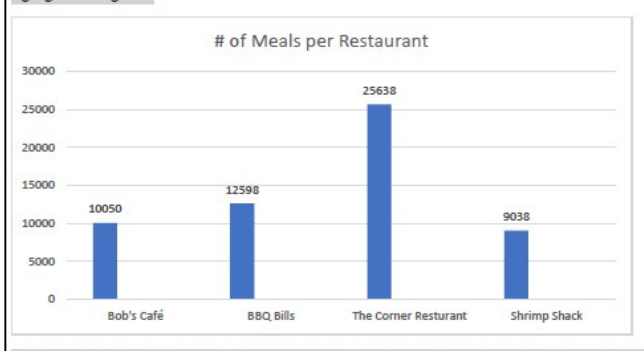
Figure B. Demonstrates the number of meals each restaurant served over the course of the grant period.