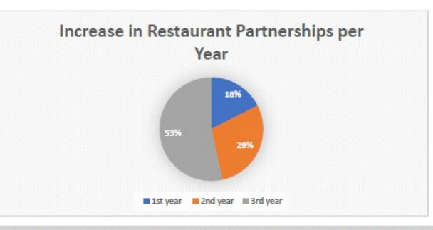
Figure A. Demonstrates the increase of restaurant partnerships per year with The lowa Department on Aging for the grant.